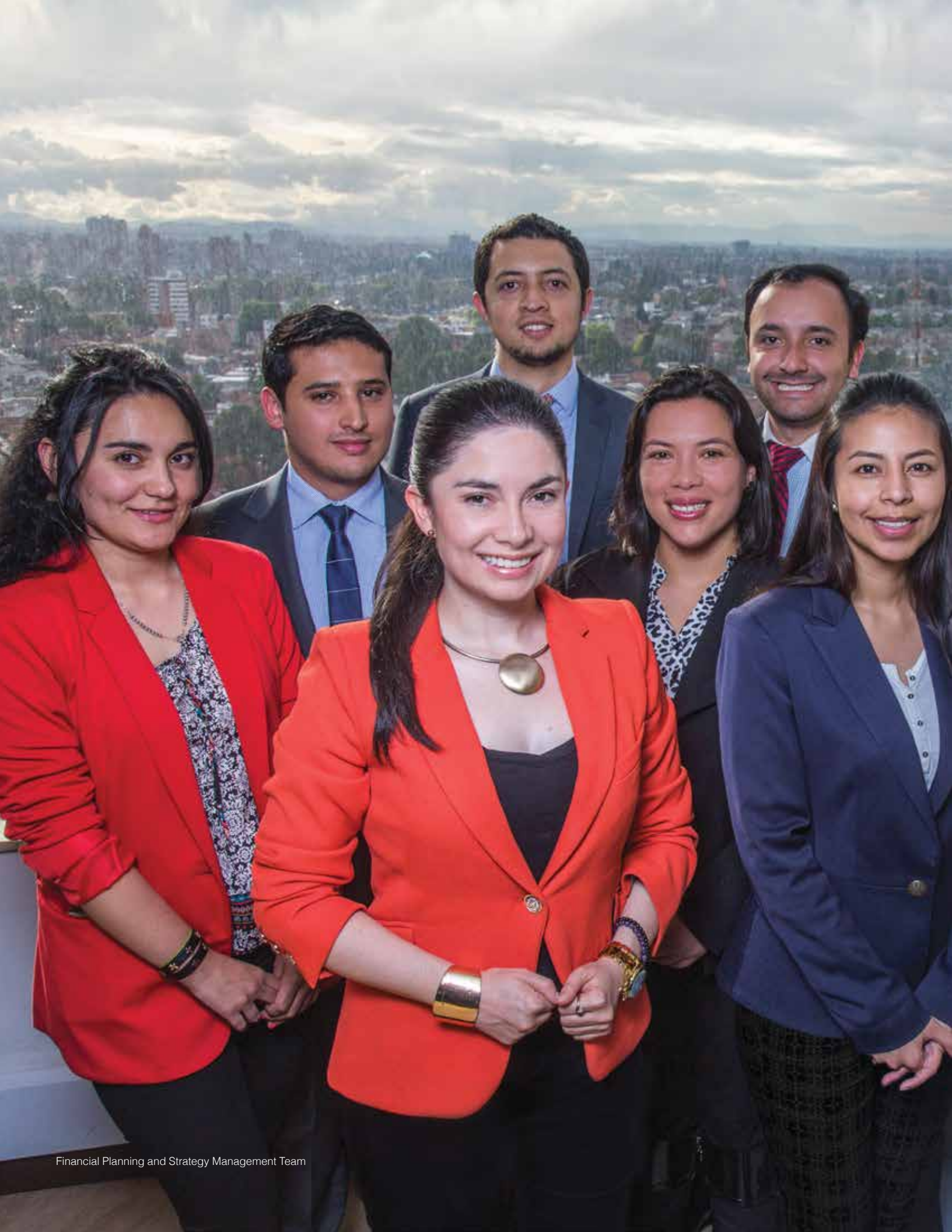
Financial Planning and Strategy Management Team